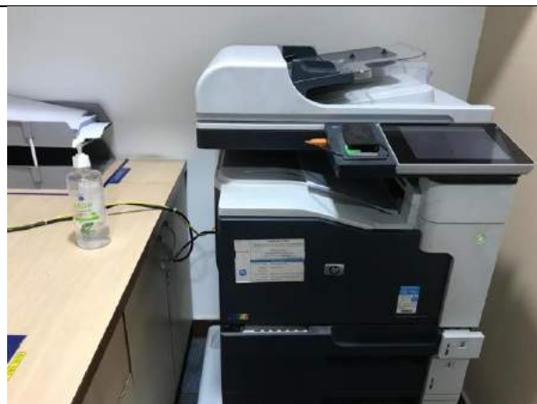
Keep sanitizers close to all common touchpoints. Be mindful of Fire Hazard