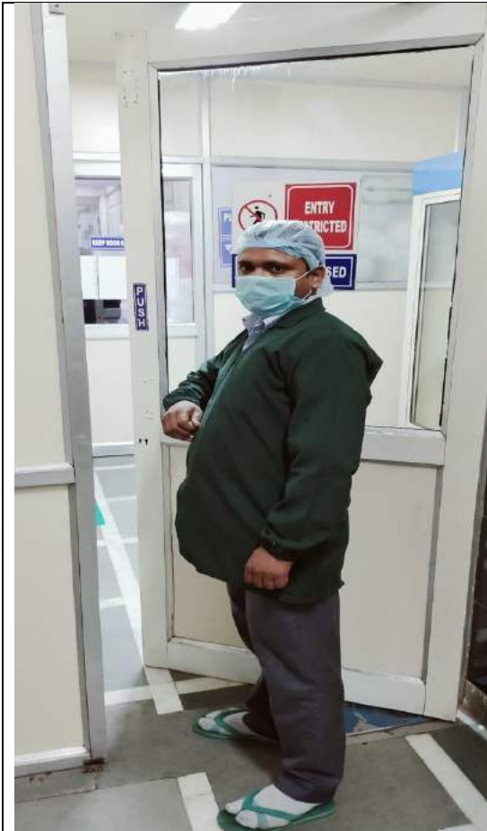
Remove Door Handles or Knobs