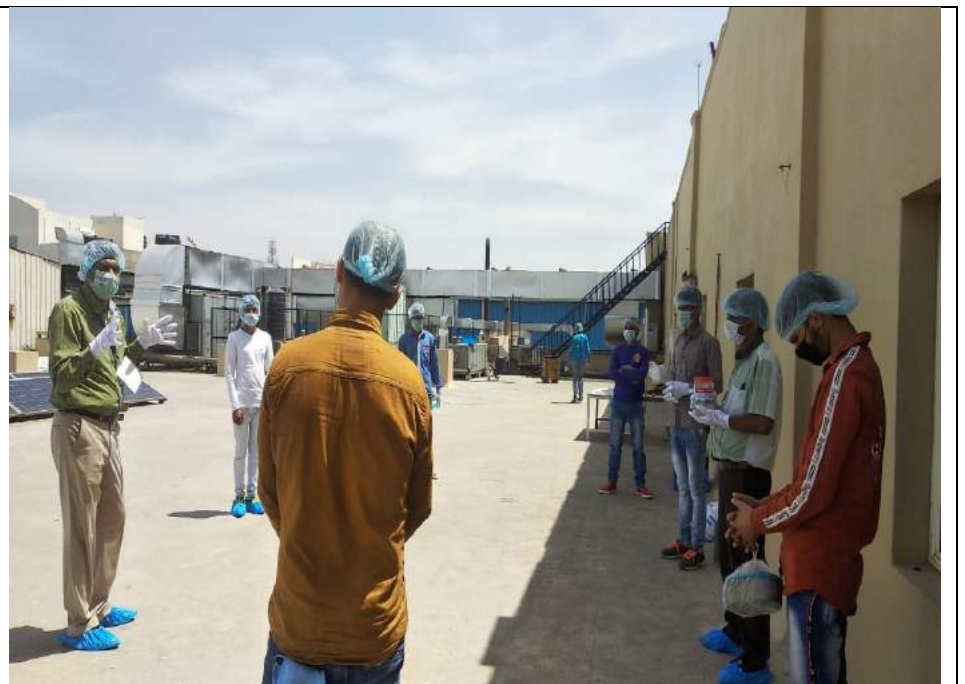
Large and Unavoidable Group Meetings can happen in Open (if you don't have access to various video-calling apps)