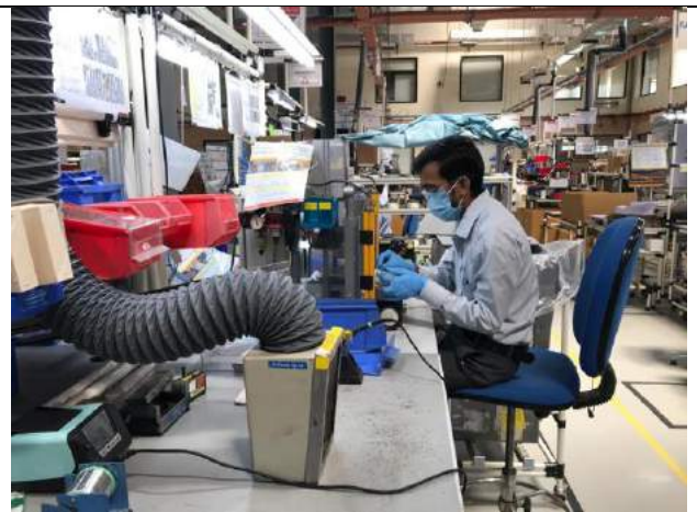
Wearing Masks is Mandatory. Gloves are required for Sensitive Production Process