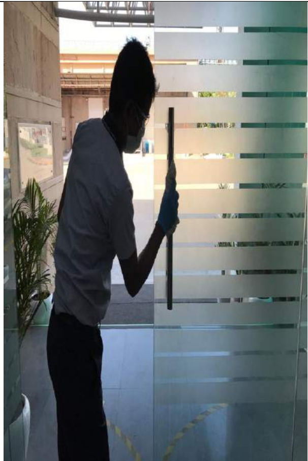
Regularly Clean the Handles that Can't be Removed