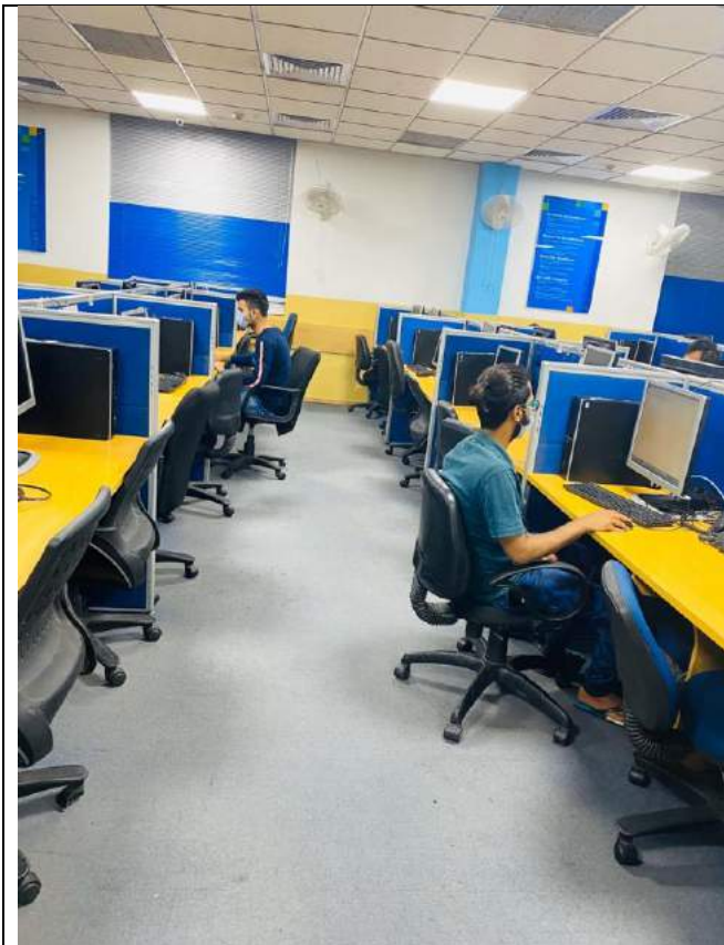
Model Work Floor with Appropriate Social Distancing