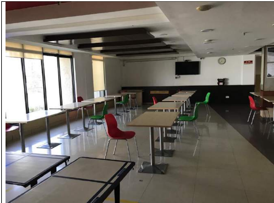
Space out the layout in Cafeterias