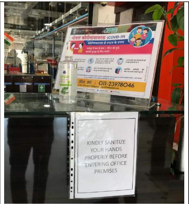
Use Posters at Multiple Places to Spread Awareness