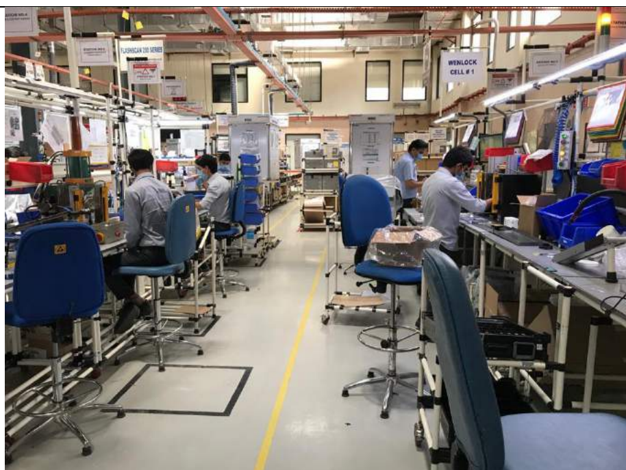
Model Process Floor with Appropriate Social Distancing