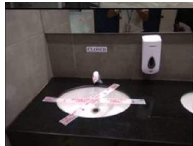
Cover the Facilities that are too Crowded to Allow Social Distancing (if there are two sinks placed less than 6 ft apart, cover one)